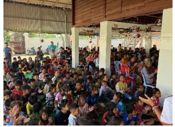
During this special time in Cambodia, we were thrilled to serve over 1,500 lives this holiday season. We thank you for your faithfulness and generosity toward His mission, helping to change the lives of many for the glory of God.